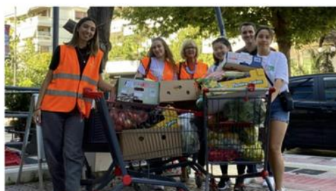
Volunteers gather produce donated by vendors from the stands of farmers' markets